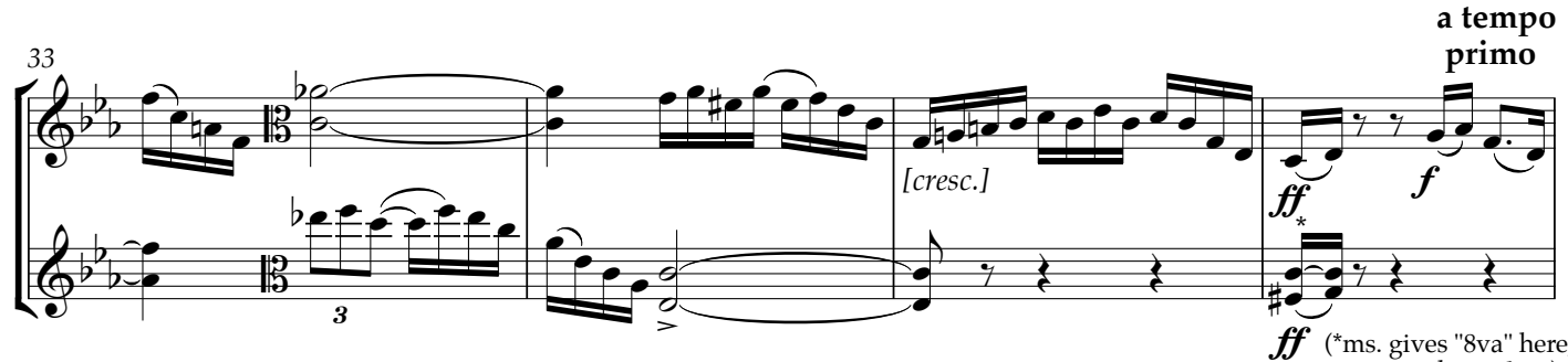
Copyright © 2008 by Christine Rutledge for Linnet Press Editions